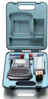
LabelManager® 210D Kit

Create distinctive custom labels for everything from safety warnings to invoice files. The result will be an unmistakable and immediate improvement in the professional appearance and effectiveness of your work environment.