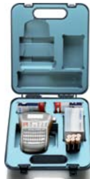
LabelManager® 220P Kit

Both label maker kits include the LabelManager® label maker with carrying case, AC adapter, 2 tapes, and 6 "AA" batteries.