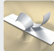
Easy-to-peel split backing

Inserts or other applications where adhesive is not required